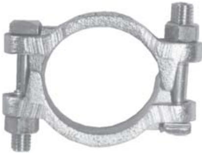
Double Bolt Clamp without Saddles For hose O.D.'s to 3.5 inches

A rugged, plated iron two-bolt clamp with machine bolts and hex nuts. Inner surface has dual gripping ridges. Bolt lugs are reinforced to prevent bending out of alignment. Torque values for clamps are based on dry bolts. The use of lubricant on bolts will adversely effect clamp performance.